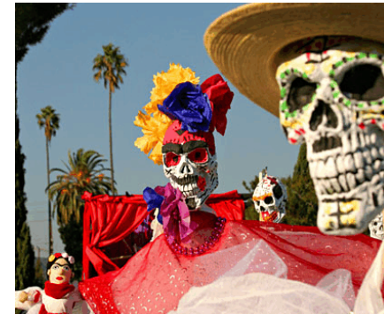
Day of the Dead Celebration

It is Samhain and the veils are thin They are the weavings of the soul of the spider It is Samhain and the veils are thin There is a reason to the madness within